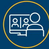
Time with teachers and peers every day