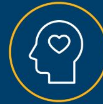
Daily focus on Social and Emotional Learning (SEL)