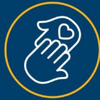
A strong school and classroom community

A sense of belonging is central to our schools in CMS. The new virtual schools will be staffed with teachers who are trained and intentional about building relationships and culture in a virtual setting.