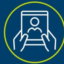
Access to school counselors and other support personnel

Each student is a valued member of our community. Staff at the CMS Virtual Schools will provide ESL, TD, EC, and 504 support specifically designed for your child in the virtual environment.