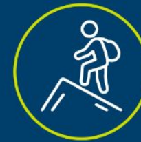
Structure that builds students' awareness and empowerment over their needs and environment