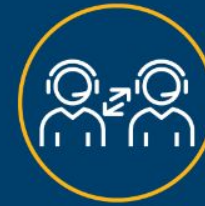
Shared experiences designed for a virtual setting