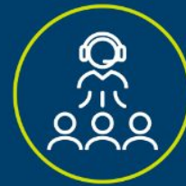
Teacher-supported small groups based on student needs